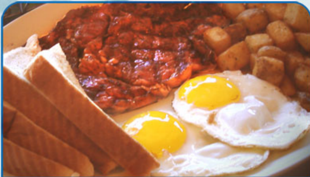
BREAKFAST 3 ..... $9.95